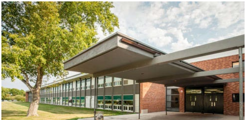
CHURCHILL HIGH SCHOOL